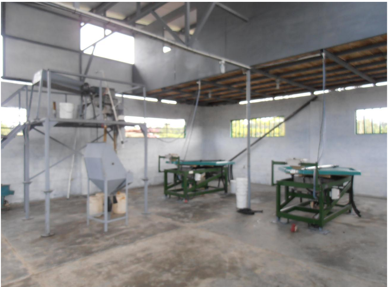
Gold room with magnetic separator and Gemini tables

During the quarter, the gold-platinum gravity circuit at the Novita bulk sampling operations was completed in earnest, with only minor modifications still being required. It is expected the circuit will be fully operational in the first quarter of 2013 following comprehensive testing and optimisation.